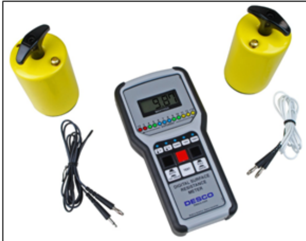
Figure 1. Desco Digital Surface Resistance Meter Kit