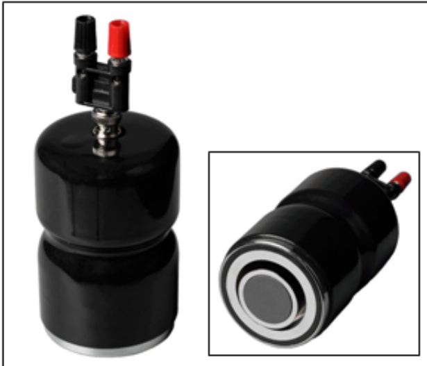
Figure 7. Desco 50005 Concentric Ring Probe

The Desco 50005 Concentric Ring Probe is an instrument to be used in conjunction with a resistance meter, such as the Desco 19787 Digital Surface Resistance Meter, to measure surface resistance per ANSI/ESD STM11.11 the test method listed in Packaging standard ANSI/ESD S54.1 for surface resistance of planar materials.