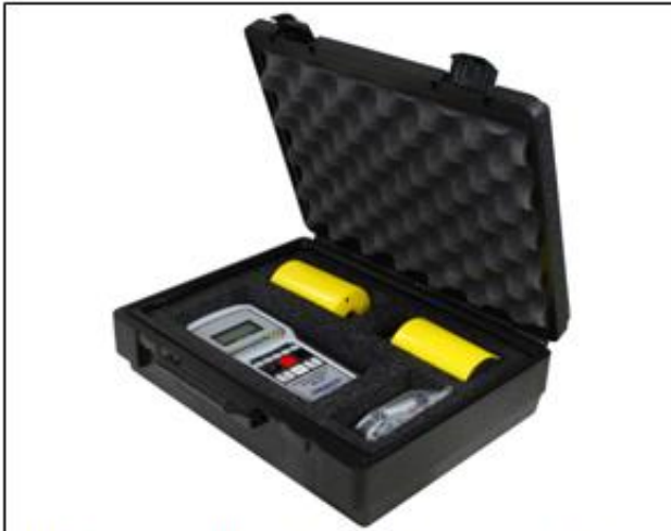
Figure 2. Desco 19787 Digital Surface Resistance Meter Kit