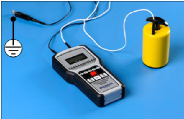
Figure 5. Rtg test setup

If the measurement is outside acceptable limits, clean the surface with an ESD cleaner containing no insulative silicone such as Reztore™ Antistatic Surface & Mat Cleaner, and re-test to determine if the cause of failure is an insulative dirt layer or the ESD worksurface material.