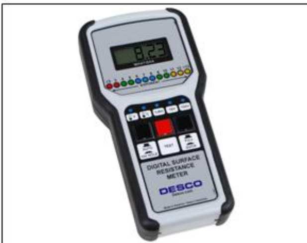
Figure 3. Desco 19788 Digital Surface Resistance Meter